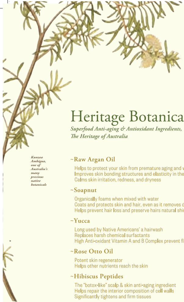
Kunzea Ambigua, one of Australia's many precious native botanicals